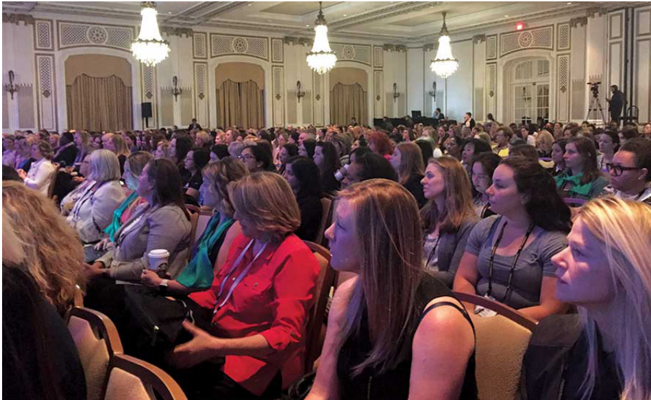
Women seeking to advance in construction-sector professional and craft careers have new levels of opportunity, but challenges remain, nearly 700 women's conference attendees learned.